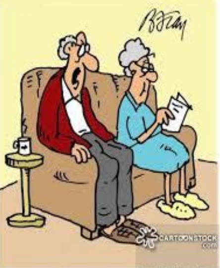
"I'M JUST SAYING, IF OUR INCOME IS 'FIXED', HOW COME WE'RE 'BROKE'?"